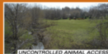
UNCONTROLLED ANIMAL ACCESS