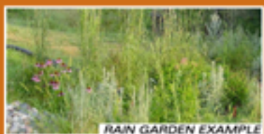
RAIN GARDEN EXAMPLE