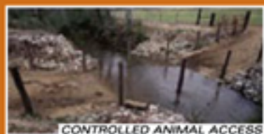
CONTROLLED ANIMAL ACCESS