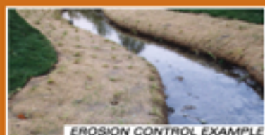
EROSION CONTROL EXAMPLE